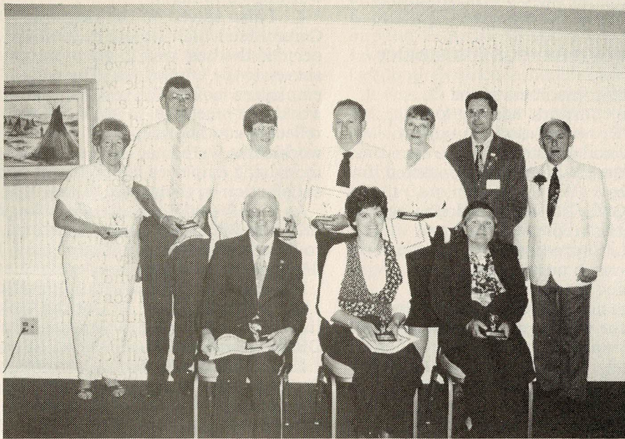
Your County Presidents (above) and County Secretary/Treasurers (below) were recognized and honored for the years of service.